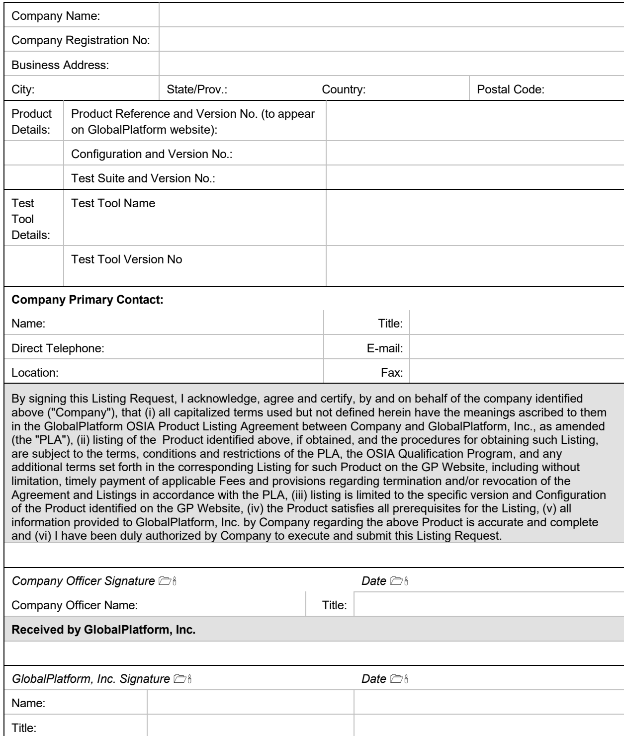
Exhibit A – OSIA Qualification Product Listing Request Form